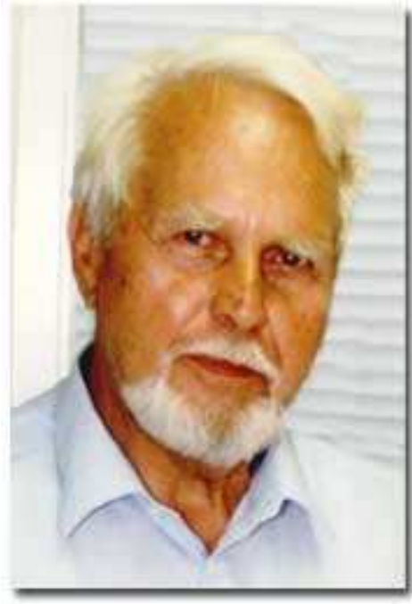
Prof. Olgierd Cecil ZIENKIEWICZ (1921-2009)